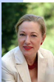
Dr. Benita FERRERO-WALDNER Former EU-Commissioner for External Relations and European Neighbourhood Policy

I do support the aims of the Institute of the Regions of Europe (IRE) and I agree on being member of the "Board of Patrons".