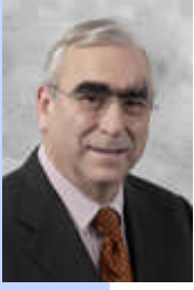
Dr. Theo Waigel Former Federal Minister for Finance, Germany