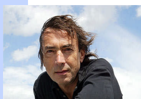
Hubert von GOISERN Song Writer and World Musician