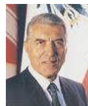
Prof. Dr. Helmut ZILK † Former President of Land Wien and Mayor of the City of Vienna Former Federal Minister for Education and Arts