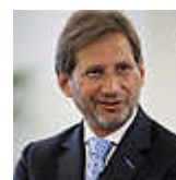
Dr. Johannes HAHN European Commissioner for Regional Policy