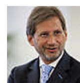
Dr. Johannes HAHN European Commissioner for Regional Policy