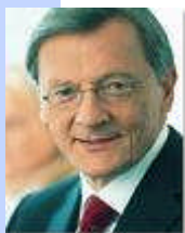
Dr. Wolfgang SCHÜSSEL Former Federal Chancellor Klubobmann