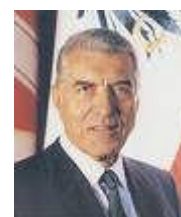
Prof. Dr. Helmut ZILK † Former President of Land Wien and Mayor of the City of Vienna Former Federal Minister for Education and Arts