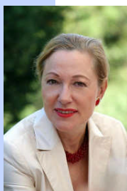
Dr. Benita FERRERO-WALDNER EU-Commissioner for External Relations and European Neighbourhood Policy

I do support the aims of the Institute of the Regions of Europe (IRE) and I agree on being member of the "Board of Patrons".