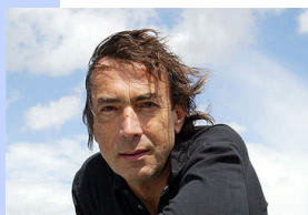
Hubert von GOISERN Song Writer and World Musician