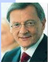
Dr. Wolfgang SCHÜSSEL Former Federal Chancellor Klubobmann